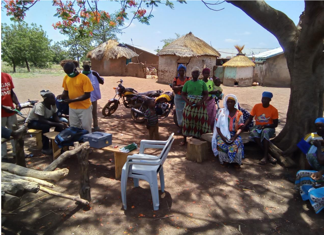
Community entry and group sensitization in Gunayili of leadership in Tang yili Day at gunaayili